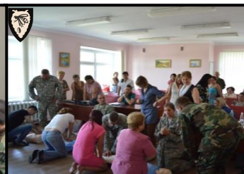
MDASPP1301225 (in Moldova) Nursing Team Ops Ph2 22-26 July 2013