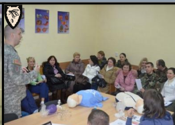
MDASPP1300046 (in Moldova) Nursing Team Operations, ph1 18-22 March 2013