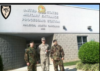
MDASPP01485 (in NC) Long-term Recruiting Planning 9-13 September 2013