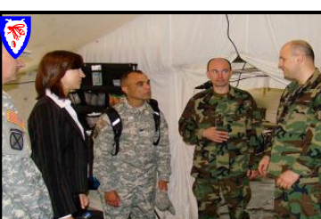
MDAEC51300012 (in Moldova) IG Ops Overview 9-13 September 2013