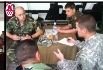
MDASPP1301713 (in Moldova) Peacekeeping Staff Ops 22-26 July 2013