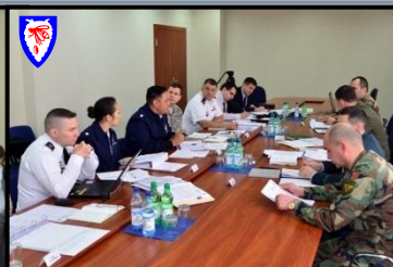
MDASPP13 (in Moldova) Mil-to-Mil Annual Plng Conf 8-9 April 2013