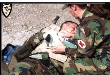
MDASPP1301719 (in Moldova) Med Response Cap Assessment 28 July – 02 August 2013