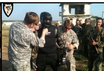
MDASPP1300007 (in Moldova) B/1/20 SF ODA2126 - ODT 5-16 August 2013