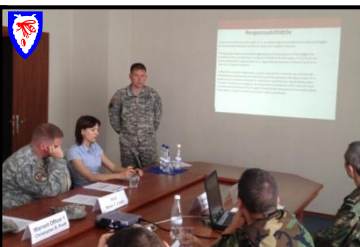
MDASPP1300011 (in Moldova) J1 Org & MOD Mngt 15-19 July 2013