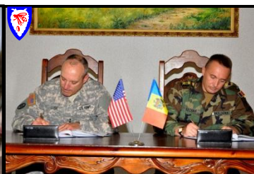
MDASPP1300016 (in Moldova) NCTAG Visit to Moldova 2 – 4 May 2013