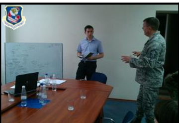
MDASPP1300009 (in Moldova) System Network Security Mngt 10-14 June 2013