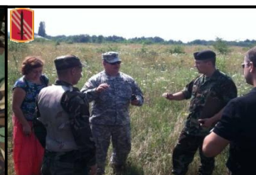
MDASPP1301720 (in Moldova) HMA UXO Disposal Capability 28 July – 02 August 2013