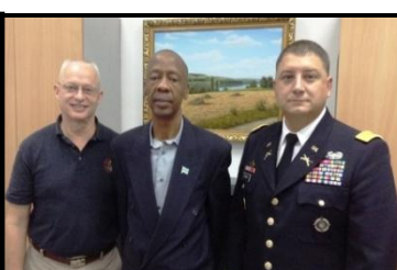
LTG(R) Masiri, Former BDF CDR (in MDA) Humanitarian Aid outreach info meeting 13 September 2013