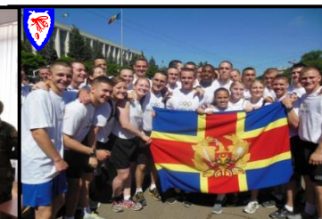
MDASPP13 (in Moldova) Army ROTC - CULP 22 May – 12 June 2013