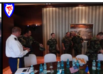
MDACMP1301699 (in Moldova) Em. Prep Capability Analysis 29 – 31 July 2013