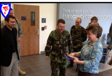
MDASPP1308684 (in NC) Disaster Prep Capacity Building 26 April – 4 May 2013