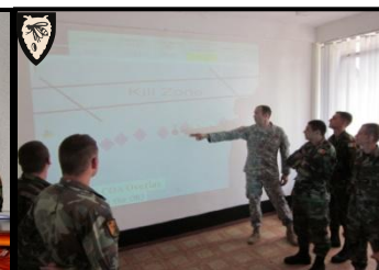
MDASPP1300008 (in Moldova) Parachute Insert Ops Planning 19-26 May 2013