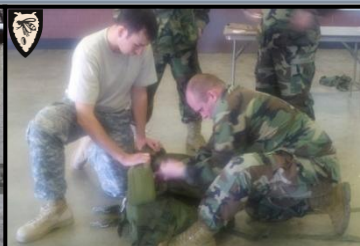
MDASPP1300006 (in NC) MDA SF visit with B/1/20 SF CO 6-12 Feb 2013