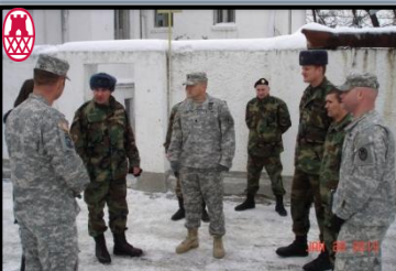
MDASPP1301479 (in Moldova) MP Ops Assessment; 28 Jan – 1 Feb 2013