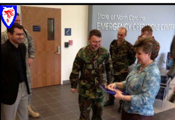
MDASPP1308684 (in NC) Disaster Prep Capacity Building 26 April – 4 May 2013