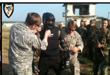
MDASPP1300007 (in Moldova) B/1/20 SF ODA2126 - ODT 5-16 August 2013