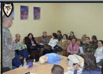
MDASPP1300046 (in Moldova) Nursing Team Operations, ph1 18-22 March 2013