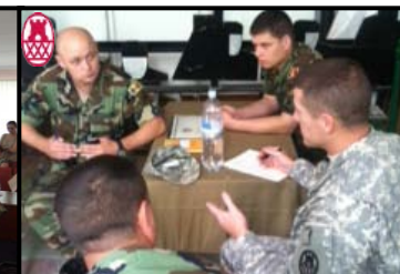
MDASPP1301713 (in Moldova) Peacekeeping Staff Ops 22-26 July 2013