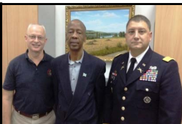
LTG(R) Masiri, Former BDF CDR (in MDA) Humanitarian Aid outreach info meeting 13 September 2013