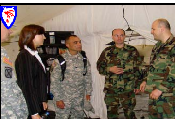
MDAEC51300012 (in Moldova) IG Ops Overview 9-13 September 2013