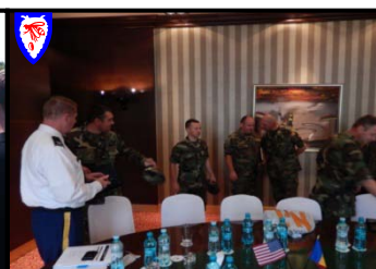
MDACMP1301699 (in Moldova) Em. Prep Capability Analysis 29 – 31 July 2013