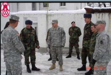
MDASPP1301479 (in Moldova) MP Ops Assessment; 28 Jan – 1 Feb 2013