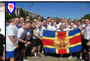
MDASPP13 (in Moldova) Army ROTC - CULP 22 May – 12 June 2013