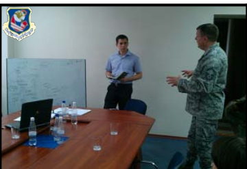
MDASPP1300009 (in Moldova) System Network Security Mngt 10-14 June 2013