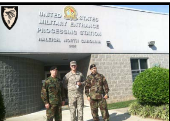
MDASPP01485 (in NC) Long-term Recruiting Planning 9-13 September 2013