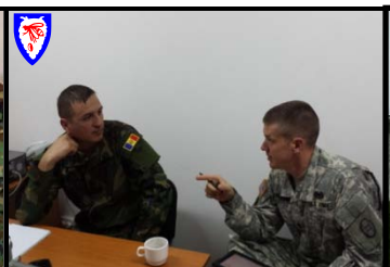
MDASPP01033 (in Moldova) Soldier Readiness Processing 9-13 September 2013