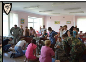
MDASPP1301225 (in Moldova) Nursing Team Ops Ph2 22-26 July 2013