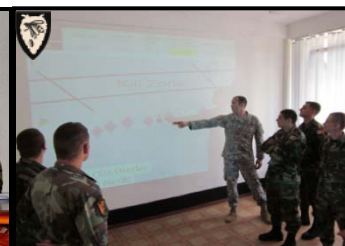
MDASPP1300008 (in Moldova) Parachute Insert Ops Planning 19-26 May 2013